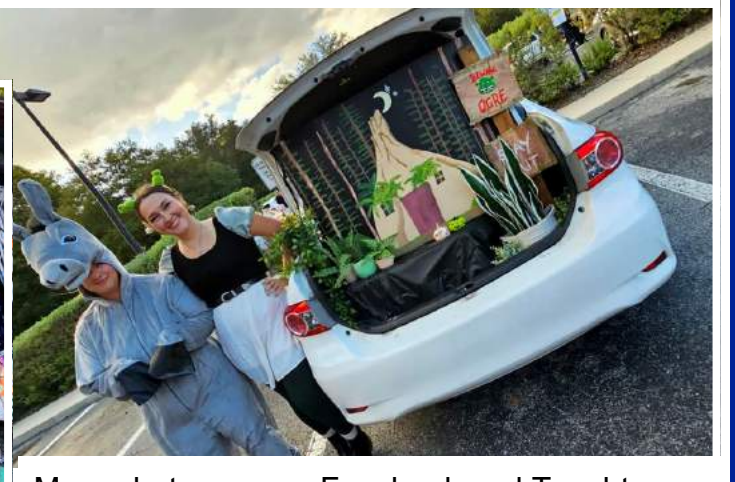
More photos are on Facebook and Touchtown.